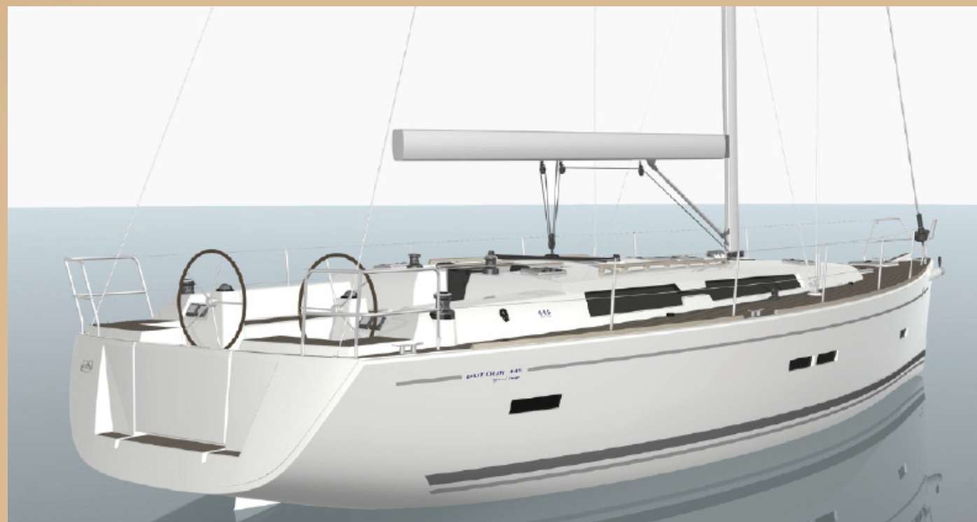
DUFOUR | 445 Grand'Large

- Standard Description - DUF0UR 445 Grand'Large - September 2011 -